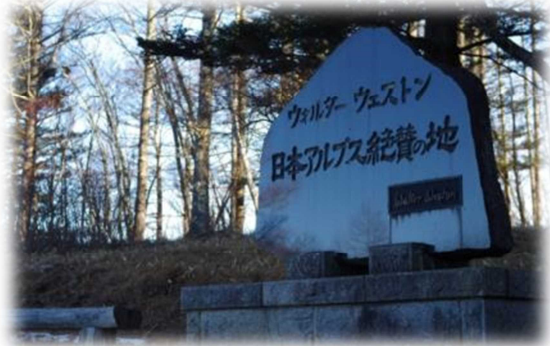
The stone monument written what Walter Weston acclaimed Japanese Alps Landscape.

Japanese Alps. There is a handwritten autograph of Weston and a part of “Mountaineering and Exploration in the Japanese Alps” written by Weston on the stone monument.