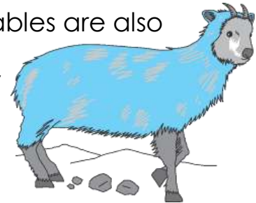
Prefectural Animal: Japanese serow