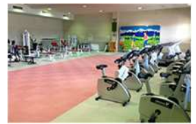
【 Training Room 】