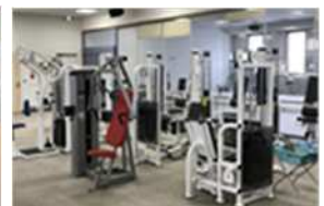
【 Training Room 】