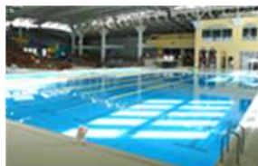
【 Swimming Pool 】