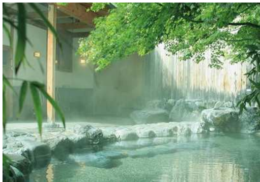
Asama Onsen (Hot spring)

Asama Onsen is a hot spring place neighboring the gymnasium. The place has a history and its hot water gently cures muscle soreness.