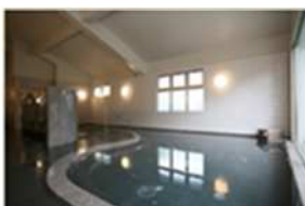
【 Indoor Bath 】