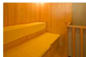
【 Sauna Bath 】