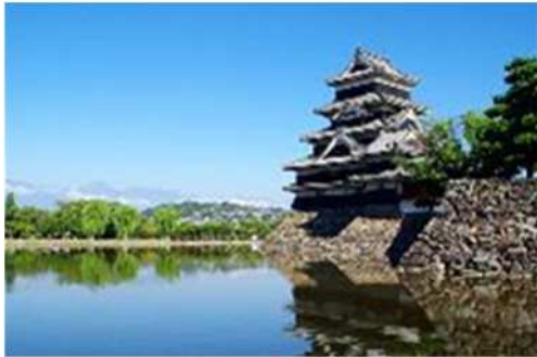
National Treasure Matsumoto Castle

Matsumoto Castle is the oldest castle in Japan and also designated as national treasure. The combination of the black and white castle and Japan Northern Alps is beautiful.