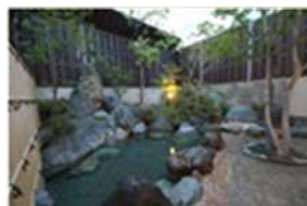
【 Open-air Bath 】