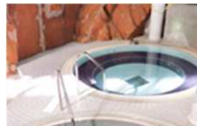
【 Jacuzzi 】