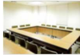
【 Meeting rooms 】