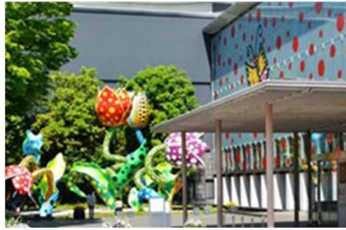
Matsumoto City Museum of Art

The museum exhibits the creations of the world's famous artist Yayoi Kusama.