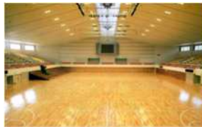
【 Arena 】